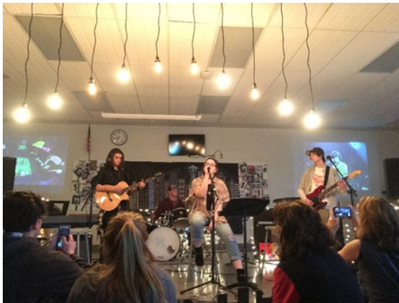
Cliché preforms "Summersong" by The Decemberists.