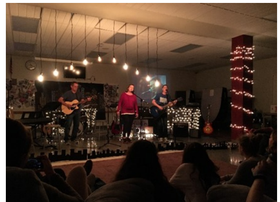
One Note performs "You Can't Always Get What You Want" by the Rolling Stones.