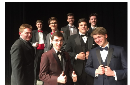
The Mr. East contestants pose in their tuxes.